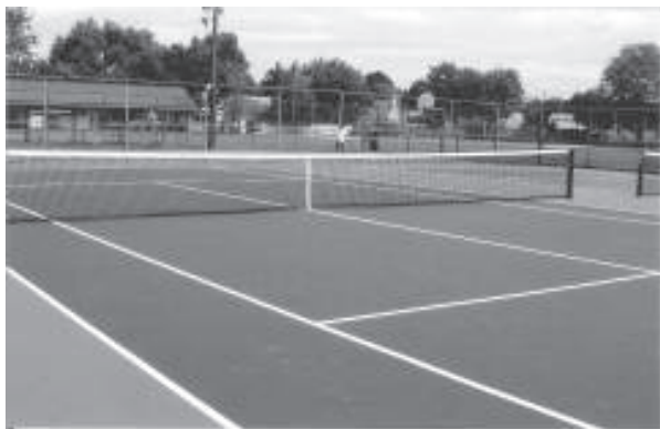
You must see the tennis courts in person to truly appreciate the deep blue color and the bright white base, foul, and side lines.