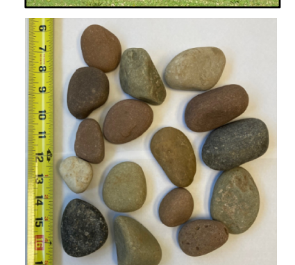
DECORATIVE RIVER STONE MULCH, 1" –2" STONE, EARTH TONES (BROWNS, TANS, & GRAYS) 6" DEPTH.