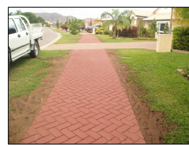
STAMPED ASPHALT BRICK – HERRINGBONE