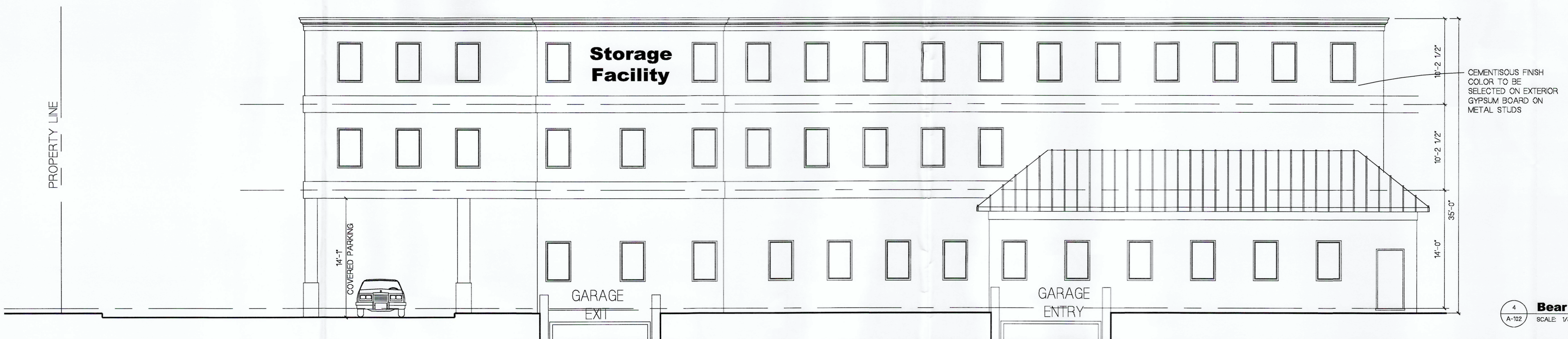
4 Bear Place Elevation SCALE: 1/8" = 1'-0"