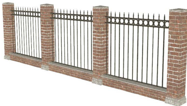
Fence with Brick Pillars