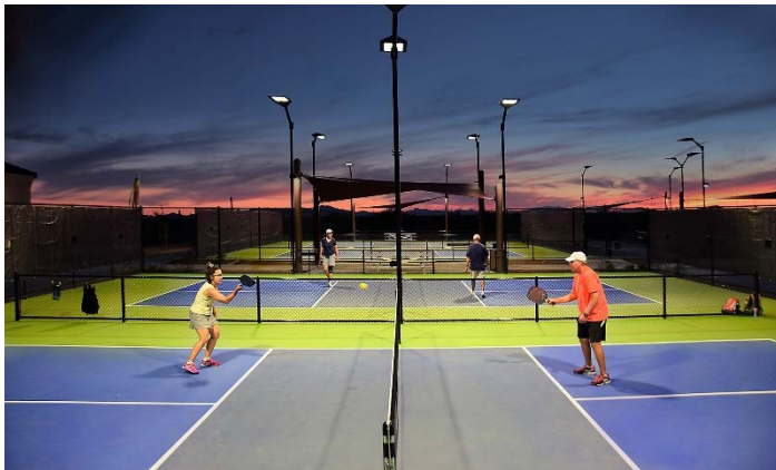
Pickleball Court with Lighting